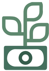
Investment Opportunities Showcase