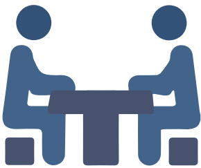
Business Conferences and Round tables